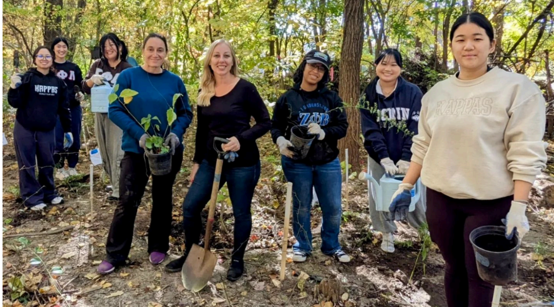
GMU students and City Council candidates plant rescues in Kutner Park – More photos