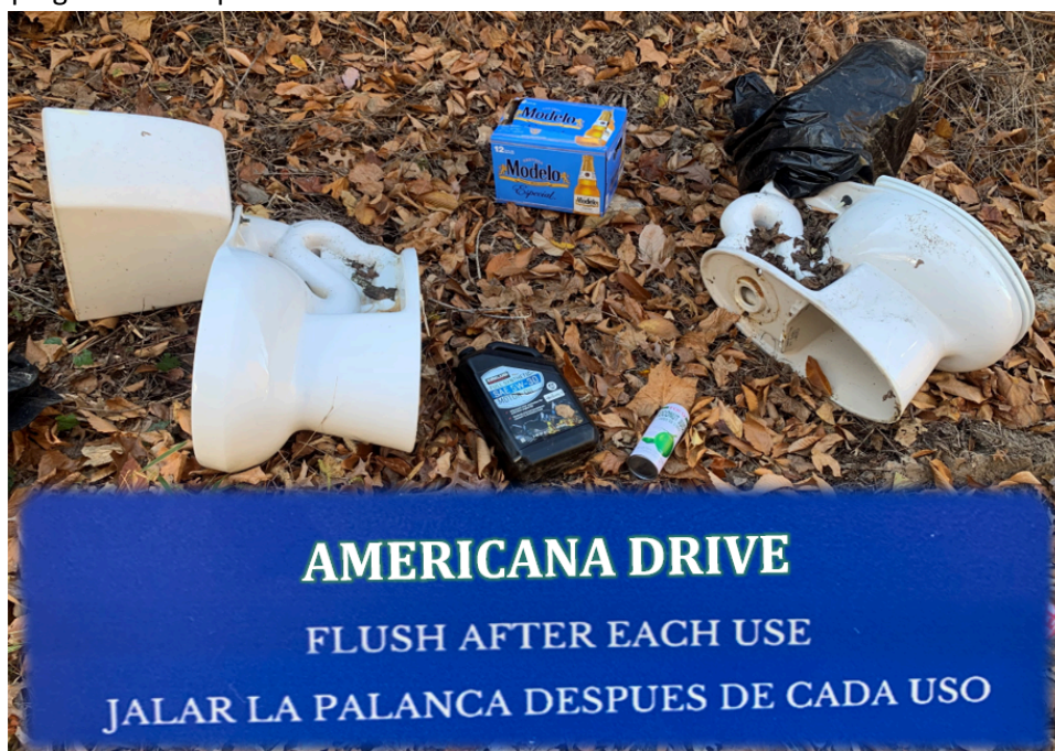
The unfortunate level of disrespect Americana Drive receives

We've been doing these cleanups for years. We do a reasonably good job of collecting the trash and leaving the area looking better each time, but we still don't have any progress to show in reducing the level of dumping in the first place.